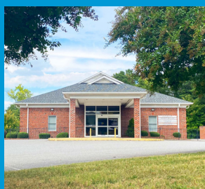
CaroMont Family Medicine - Shelby

Congratulations to our doctors and nurses at CaroMont Family Medicine in Shelby.