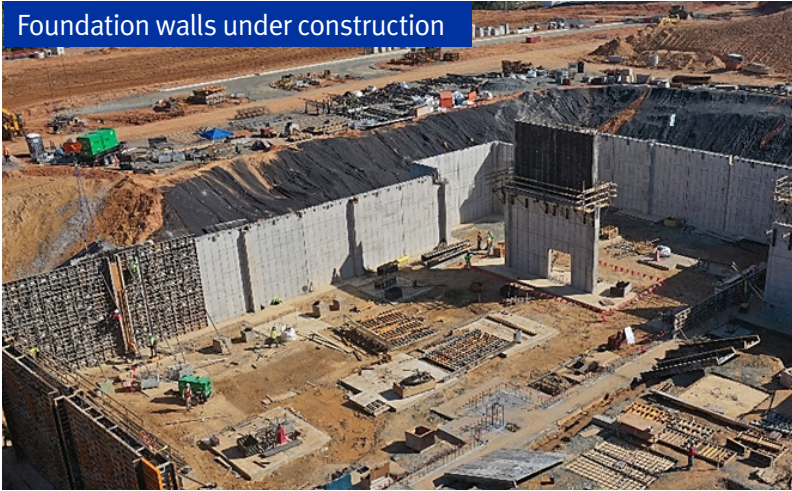
Foundation walls under construction